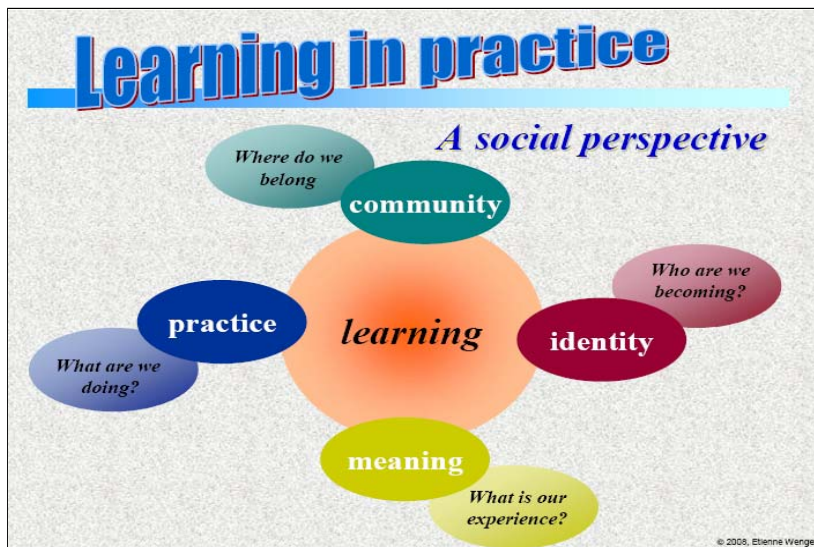
Figure 1: A social perspective of learning in practice (Source: presentation by Etienne Wenger)

This session included a presentation by Etienne Wenger and a discussion with him on social perspective of learning and communities of practice. 6