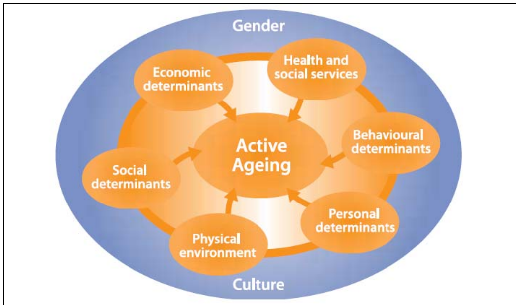
Figure 1 : Determinants of active ageing (WHO 2002)

Education is an important determinant of active ageing. Low levels of education and illiteracy are associated with increased risks of disability and death among people as they age, and higher rates of unemployment. The WHO suggests that education in early life combined with opportunities for lifelong learning can help people develop the skills and confidence they need