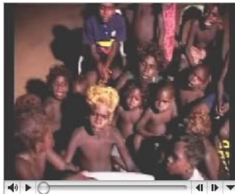
Movie 1. [NOTE: In the Web version, this is a playable movie.]

The second way this role is different in a CAN is its supplementary nature. Owing to the large numbers of community members around the computer, any content that is to be tested by the user has most probably been scrutinised by some other member of the group around the computer. One example of this is the navigational commands given to the computer to access the different talking books in a complex and dynamic social context. This can be seen in the following video of the children interacting around the touch-screen.