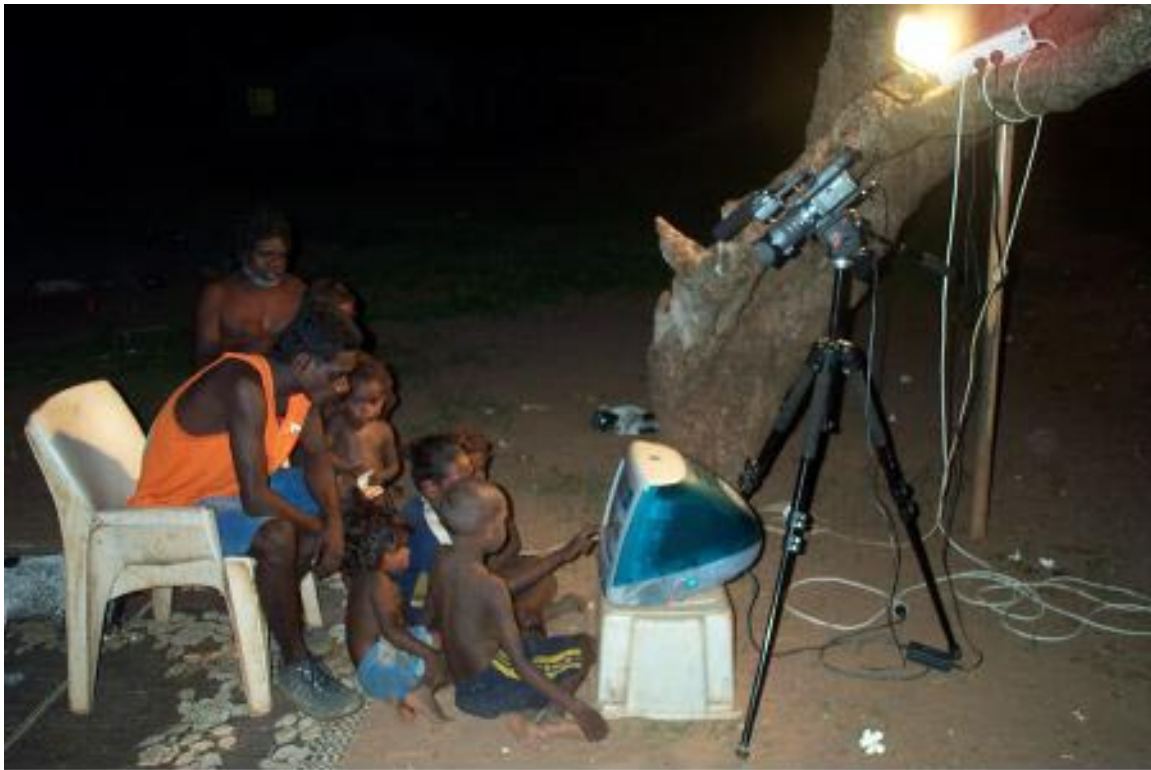
Figure 3. The context of Computer Assisted Ndj bbana in Maningrida